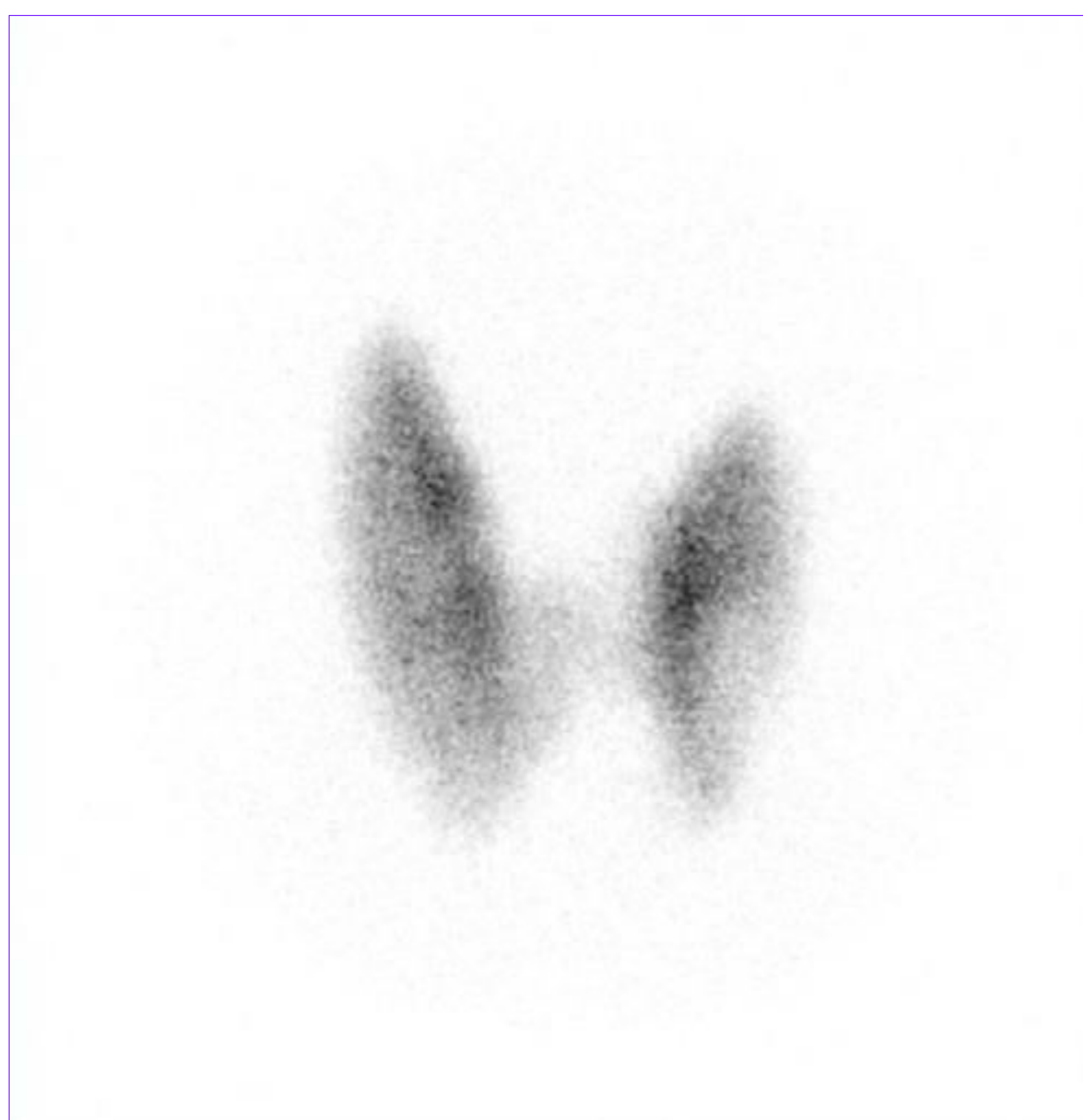
Fig 1 . Radio-isotope uptake scan