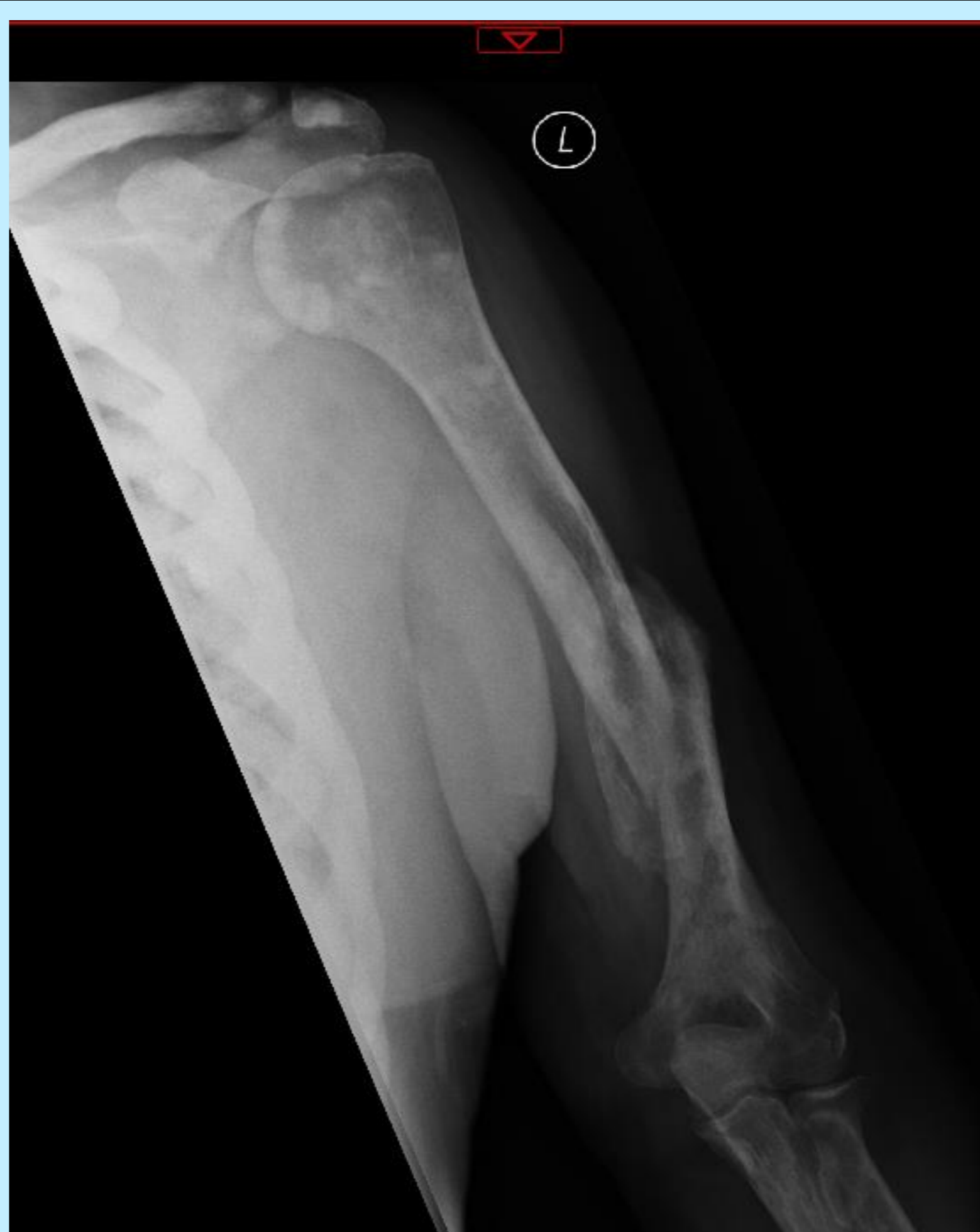
Figure 1. Humeral fracture with sclerotic lesions in ribs, clavicle and humerus

The results are in line with a diagnosis of metastatic prostate cancer. An interesting point about this case was the route of diagnosis. Unfortunately, the sclerotic bone lesions identified on this patient's admission x-rays in November 2016 were overlooked by the orthopaedic surgeons, and it was in fact interpretation of the DEXA scan that identified the bony metastases. Ideally, the lesions would have been identified along with the fracture of the humerus, and if this was the case the patient would have had the same line of investigations as above, but significantly earlier.