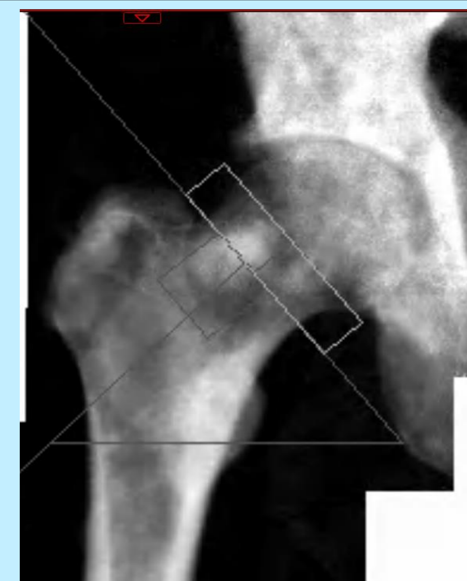
Figure 2. DEXA scan of right hip showing sclerotic lesions