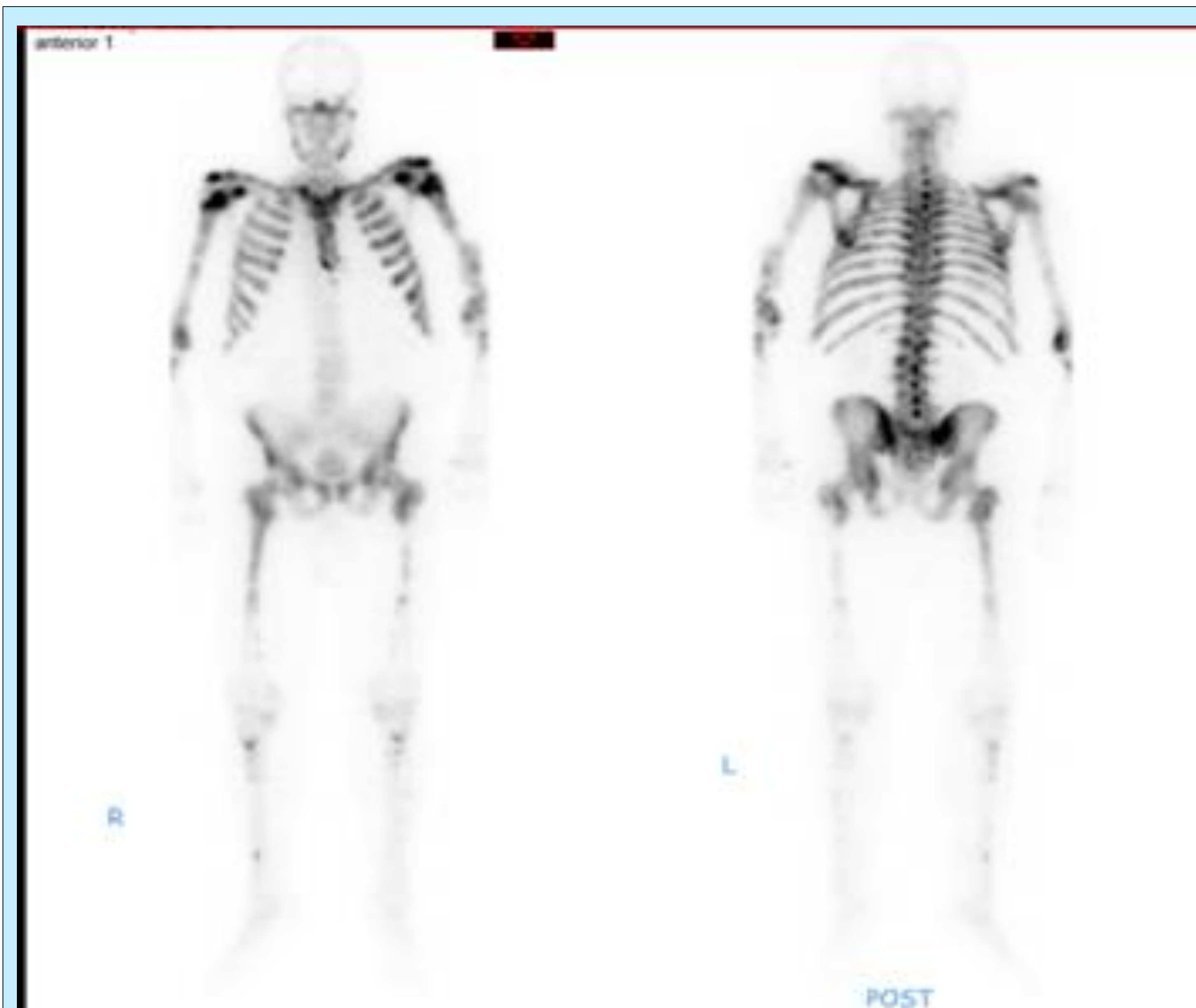
Figure 4. Isotope bone scan showing widespread uptake in the appendicular and axial skeleton, and some uptake in facial bones.