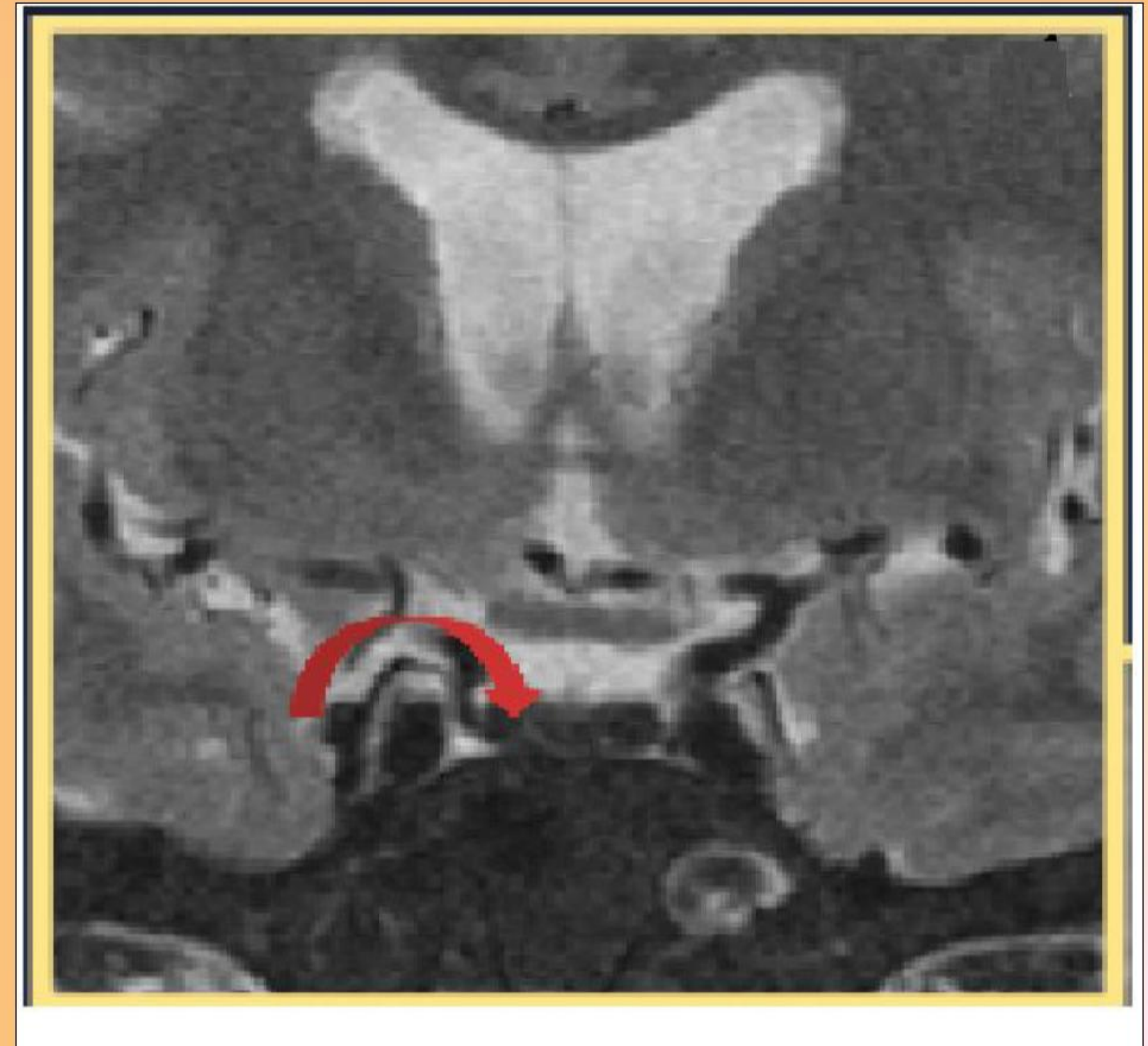
Anterior pituitary in T2 hypointense indicating iron overload