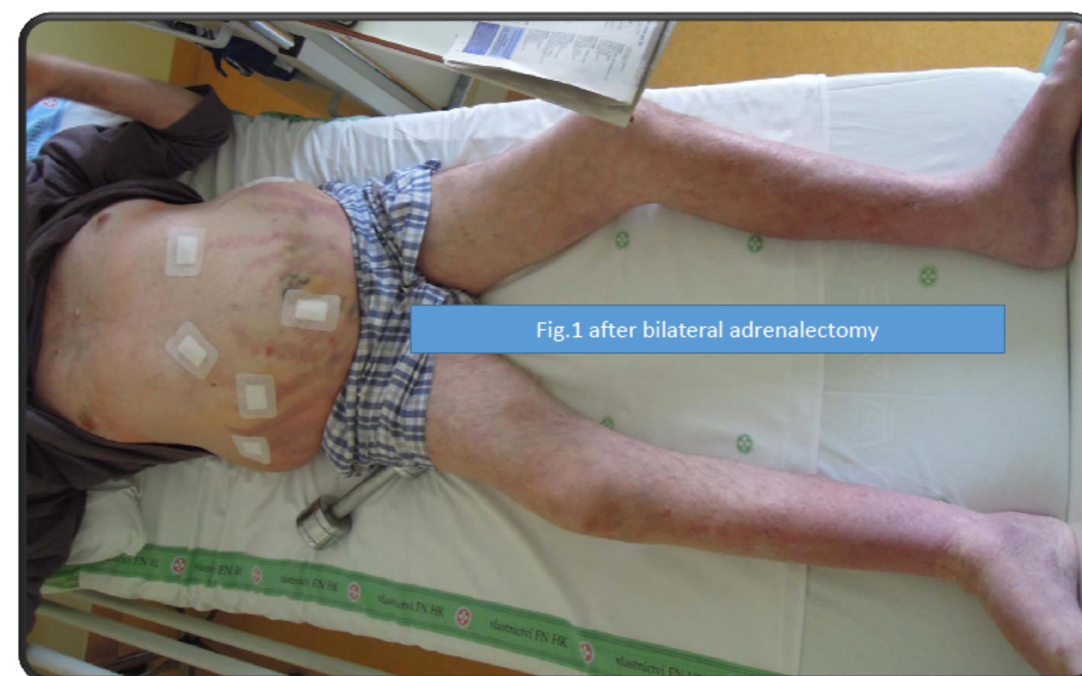
Fig. 1 after bilateral adrenalectomy

Patient was doing well, reporting better quality of life and physical condition. Unfortunately 16 month after pasireotide introduction he was admitted for diabetes decompensation (glycaemia 37 mmol/l) and bad condition for symptomatic CD (plasma cortisol > 2000 nmol/l, ACTH 321 pg/ml, UFC 12240 nmol/24h). Pasireotide was discontinued, treatment with insulin was started. For fast deteriorating of his clinical status due to active CD he was indicated to laparoscopic bilateral adrenalectomy as "ultimum refugium". The patient is now dispensarized for eventual Nelson's syndrome.