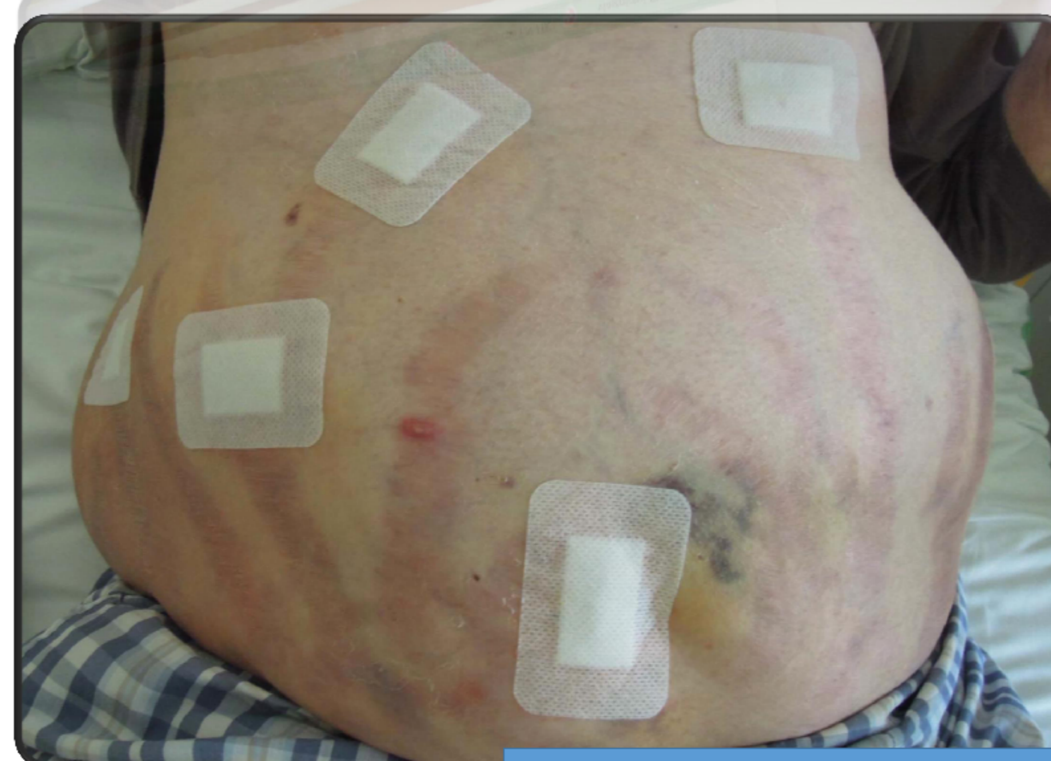
Fig. 2 after bilateral adrenalectomy