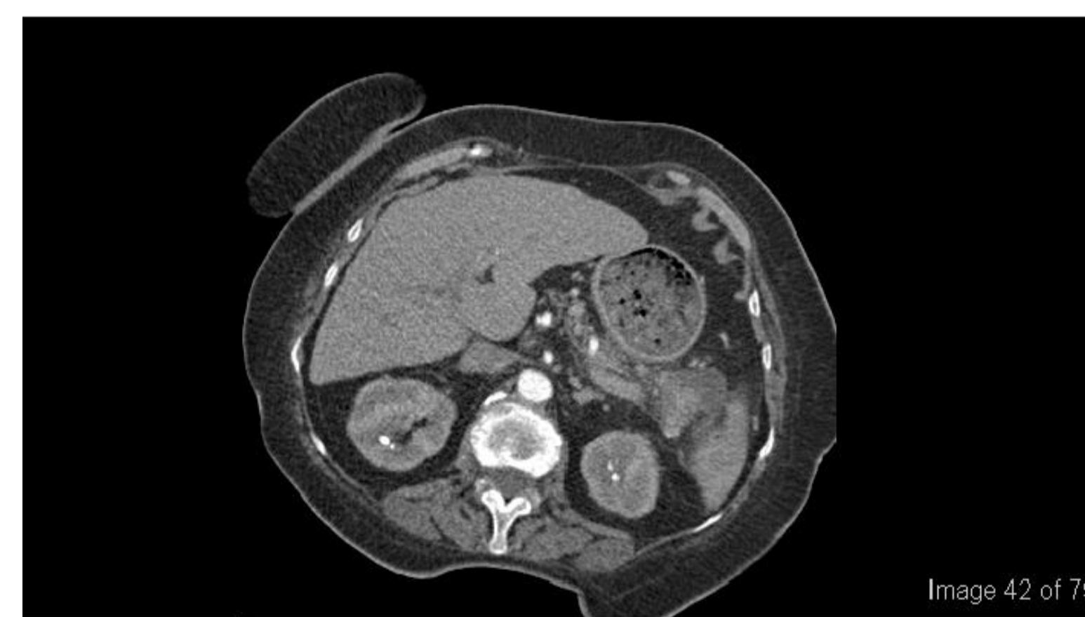
CT of abdomen revealing a pancreatic pseudocyst.