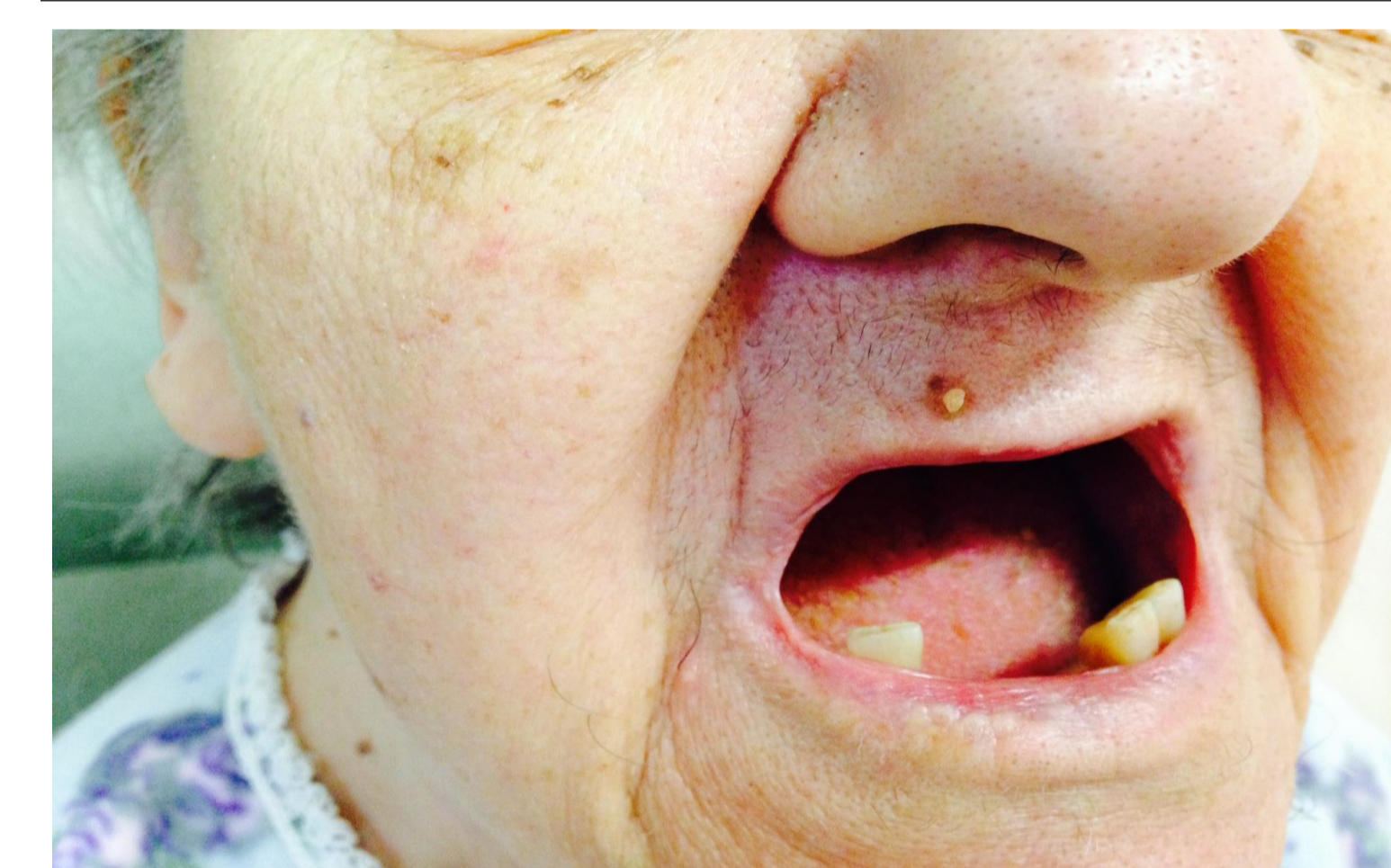
Image of patient showing poor dentition.